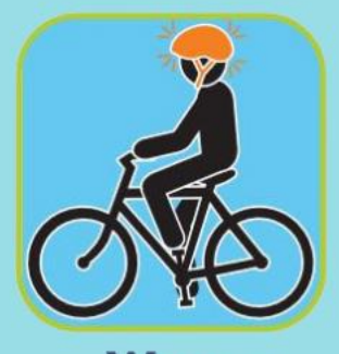
Wear a helmet.