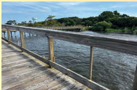
~50 ft of railings forcibly removed, July 28

During late- July, a group of vandals damaged a section of the sound side boardwalk, causing a significant safety issue for pedestrians. In response, the Town Council authorized the Police Department to design a video surveillance system using existing funds within the department's budget. The system is being installed with the support of volunteer and Town staff labor.