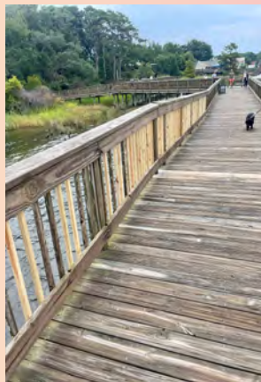
Repairs completed, August 4

Installation is expected to be completed early Fall 2023. Keep an eye out on our website and social media accounts to see when the Sunset Cam goes live!